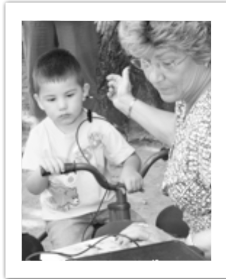
Figure 3 Trainee Learning to Screen in a Natural Setting

Monitoring program quality. Similar to hospital-based screening efforts, there are a number of ways that Early Head Start program staff can be encouraged by EHDI professionals to monitor the quality of their screening programs. (Additional resources can be found at kidshearing.org/resources/track ).